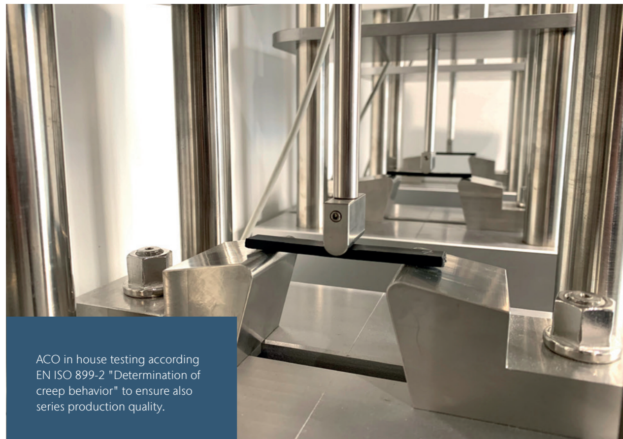
ACO in house testing according EN ISO 899-2 "Determination of creep behavior" to ensure also series production quality.