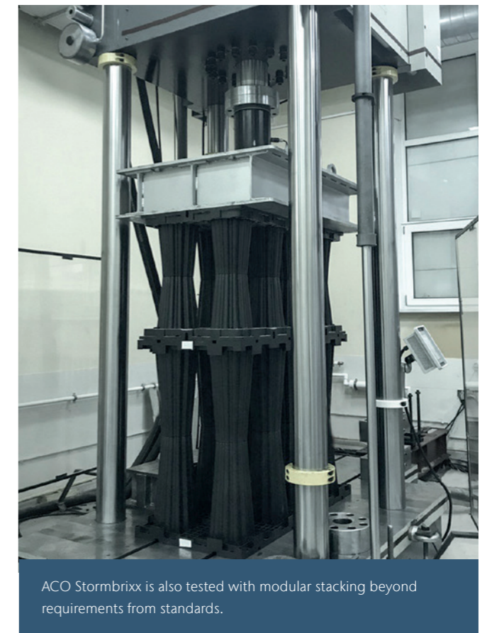
ACO Stormbrixx is also tested with modular stacking beyond requirements from standards.

* may vary for different article numbers